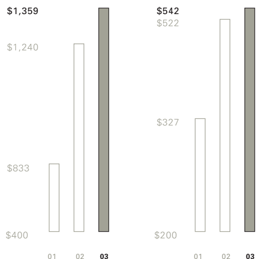
Gross Profit (In millions)

In 2002, the Company determined that its $100 million interest rate swap was ineffective. Consequently, the $10.7 million unrealized loss associated with the swap was recorded as a realized loss in interest expense during the fourth quarter of 2002. The Company continues to carry the liability on its consolidated balance sheets, and the interest rate swap is marked to market at the end of each reporting period. The change in fair value for the year ended December 31, 2003, was not significant.